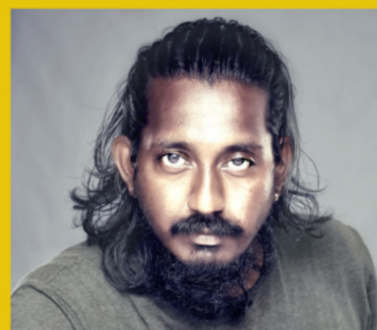
Bavishe Balan Still Photographer