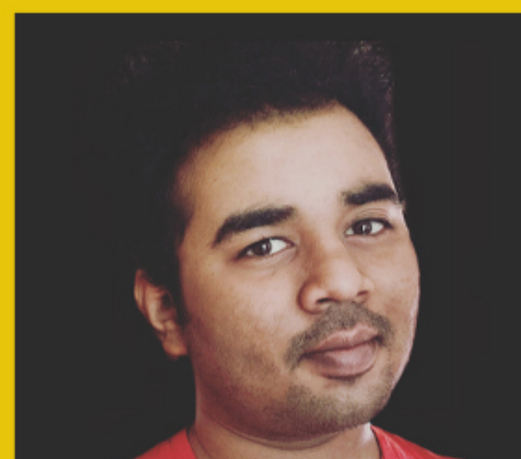
Shravan Content writer