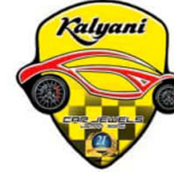
Kalyani Car Jewels Since 1995